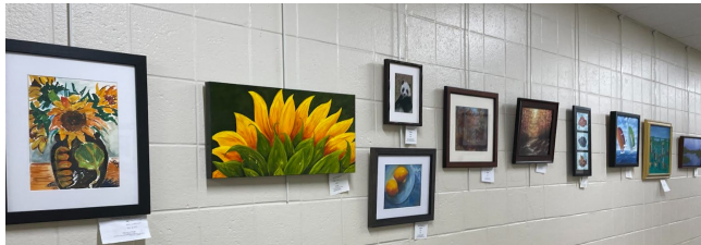
October 24th changeover—new art on the walls