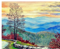
"Sunset on Skyline Dr."