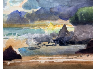
The Coming Storm