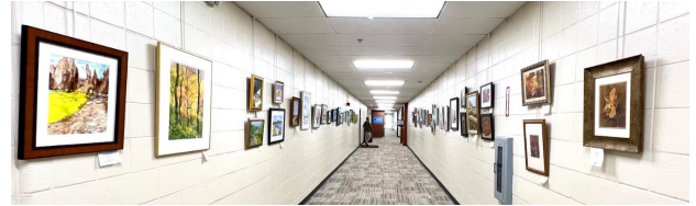
Art at Springhill

Our first exhibit of this season took place at Springhill for six weeks from September 12th. The art received many compliments from the visitors. MAS also had 5 sales at the Springhill Rec Center. The new art went up on the walls on October 24th. The next changeover date is December 5, 2023.