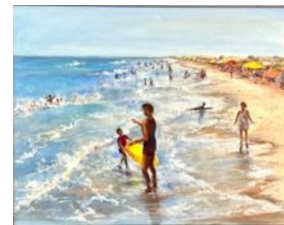
"Watching People at the Beach"