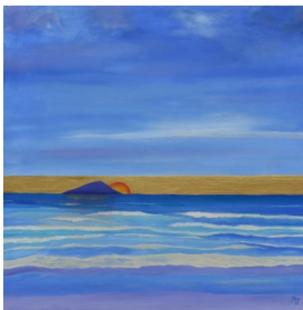
"Hope for Tomorrow"