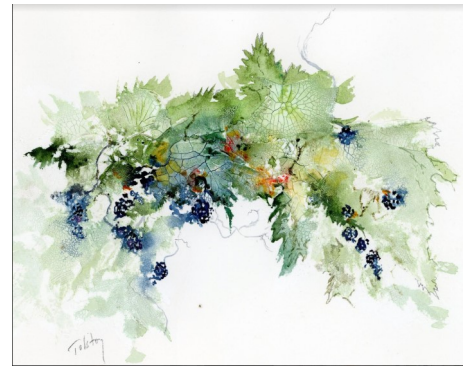
Blackberries and Leaves, PVW Show

Selected by Readers and published in the Art of Watercolor magazine issue 47. Had two paintings in the Potomac Valley Watercolorists show at Spring Valley.