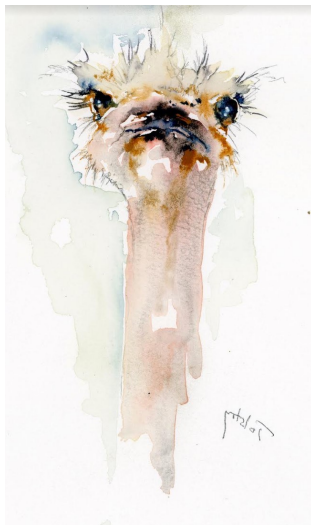
Ostrich Head, Art League