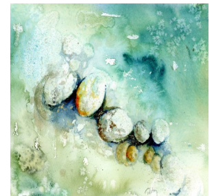
Stepping Stones Athenaeum