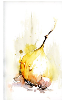
Two Bulbs AWC Vol 46

One image was selected in Reader's Competition for The Art of Watercolor magazine Vo 46. I did a Webinar with South African artist Derric Van Rensberg hosted by ShopKeepArty. I participated in PVW Brookside Gardens Sep 19 - Oct 24; Athenaeum "Potomac River Life", VA (Jul 14 - Aug 21) juror: T. Murray; AL exhibit (Aug) juror: J. Boyland; and had a SEMI-SOLO show at Arts Club of Washington (Oct 7 - Oct 30)