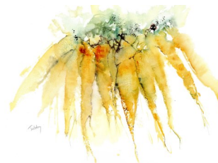
Carrots in a Bunch AL in August