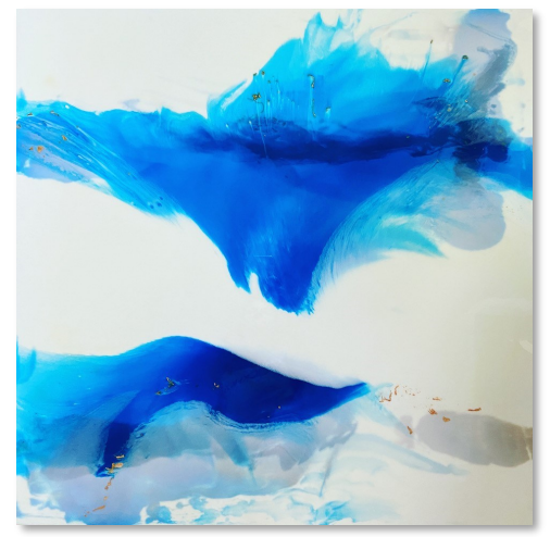
When we Meet 36x36