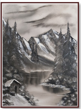
Shades of Brown