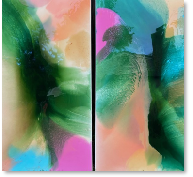
I am the Vine & You are the Branches 24x48