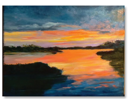
View from a Friend's Condo