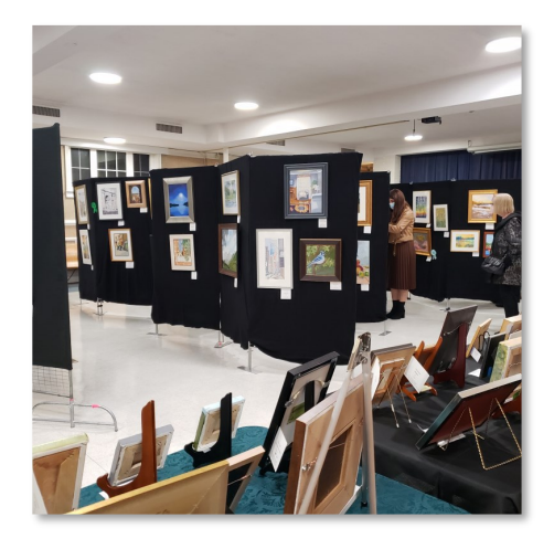
4102 N. Glebe Road Arlington VA, 22207