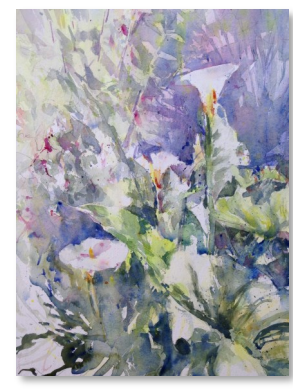
Portland Lilly 16" x 22" from 2016

//www.theartleague.org/event/patrons-show-fundraiser-