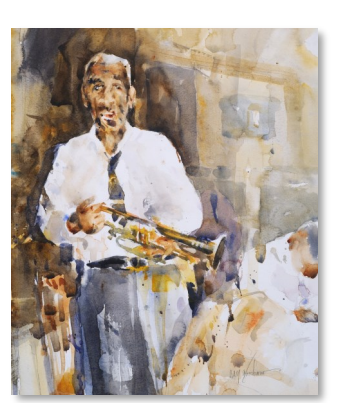
Lucky Chops 16" x 22" from 2020

I have donated two watercolors for inclusion in the 2022 Patrons Show at the Alexandria Art League. The online show this year is Sunday, February 20, 2-6pm. Individual tickets are $225., sales end February 19. This yearly event is the primary fundraiser for the Torpedo Factory Art Center. Typically a ticketholder can choose from over 600 works of art donated by Torpedo Factory exhibiting artists. The available artworks are currently up on the art league website. Details are at