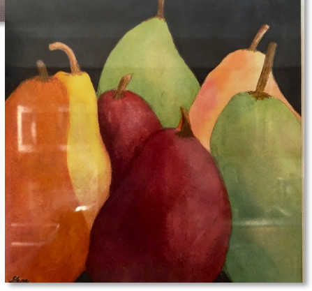
Pears ~ watercolor 11" x 14"