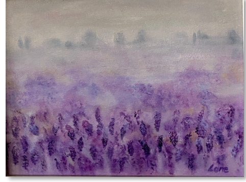
Lavender in Provence